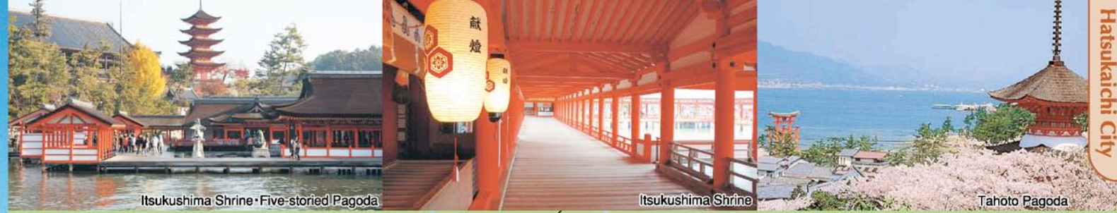
Itsukushima Shrine • Five-story Pagoda